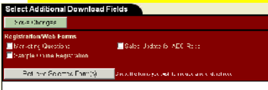
Figure 4: Select Forms and Click Retrieve

Select custom forms and related questions to include in download template: The Select Additional Download Fields Window will display all forms available for download. Click the checkbox for the form(s) you wish to include and then click the Retrieve Selected Forms button (see Figure 4). The selected forms, including all questions for each form will display in the area below (see Figure 5). Select the questions you wish to include in your download and, when finished, be sure to click the Save Changes button at the top of the window to save the custom forms settings for this download template (see Figure 5). After clicking changes, the new/edited template, including custom forms, will be immediately available for use when downloading search results, including in the "Download Search" drop-down list available on any search results page (see Figure 6).