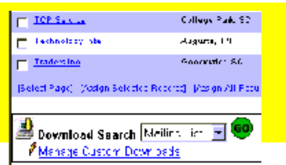
Figure 1: Manage Custom Downloads Link on Search Results Page

To include multiple forms in a custom download: From the bottom of any search page, click on the Manage Downloads link (see Figure 1). In the Manage Downloads list window, click the Edit hyperlink for the template you wish to modify. Alternately, if you are creating a new download template, click on the Add hyperlink to the left of "Create New Custom Download" in this window. In the first step, select the checkboxes for the standard database fields you wish to include in the template and then click Save Changes (see Figure 2). The system will then prompt you as to whether you wish to include information from custom forms in your download template; to include one or more forms, click Yes (see Figure 3). If you are editing a form that already has a custom form(s) attached, you will be taken automatically to this step.