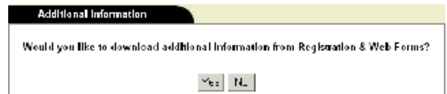
Figure 3: Select Yes to Include Custom Forms in Download Template