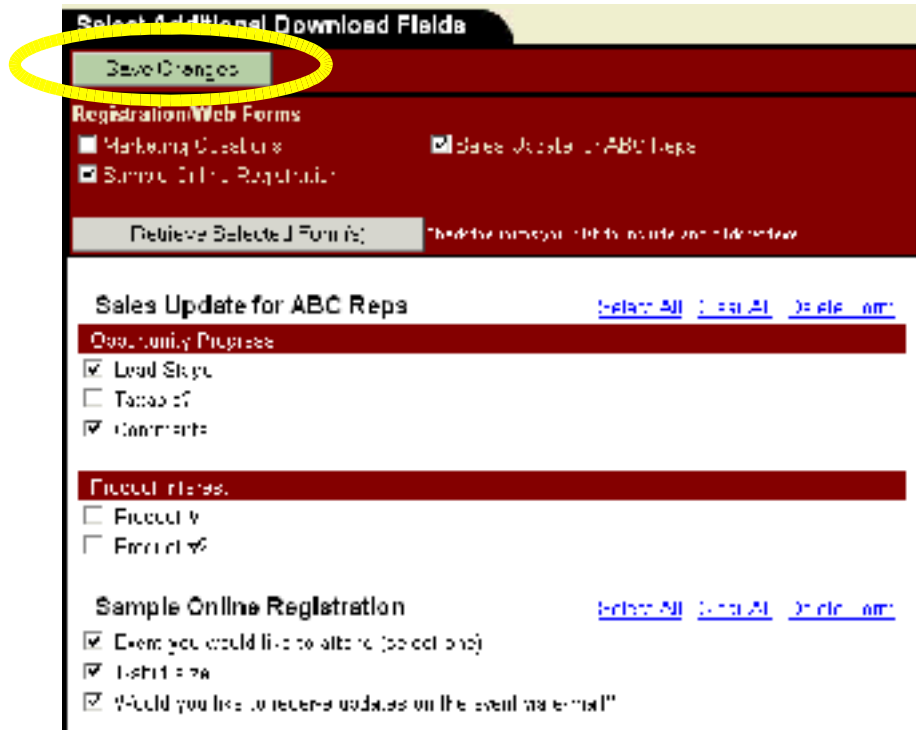
Figure 5: Select Questions to Include From Custom Forms

for use when downloading search results, including in the "Download Search" drop-down list available on any search results page (see Figure 6).